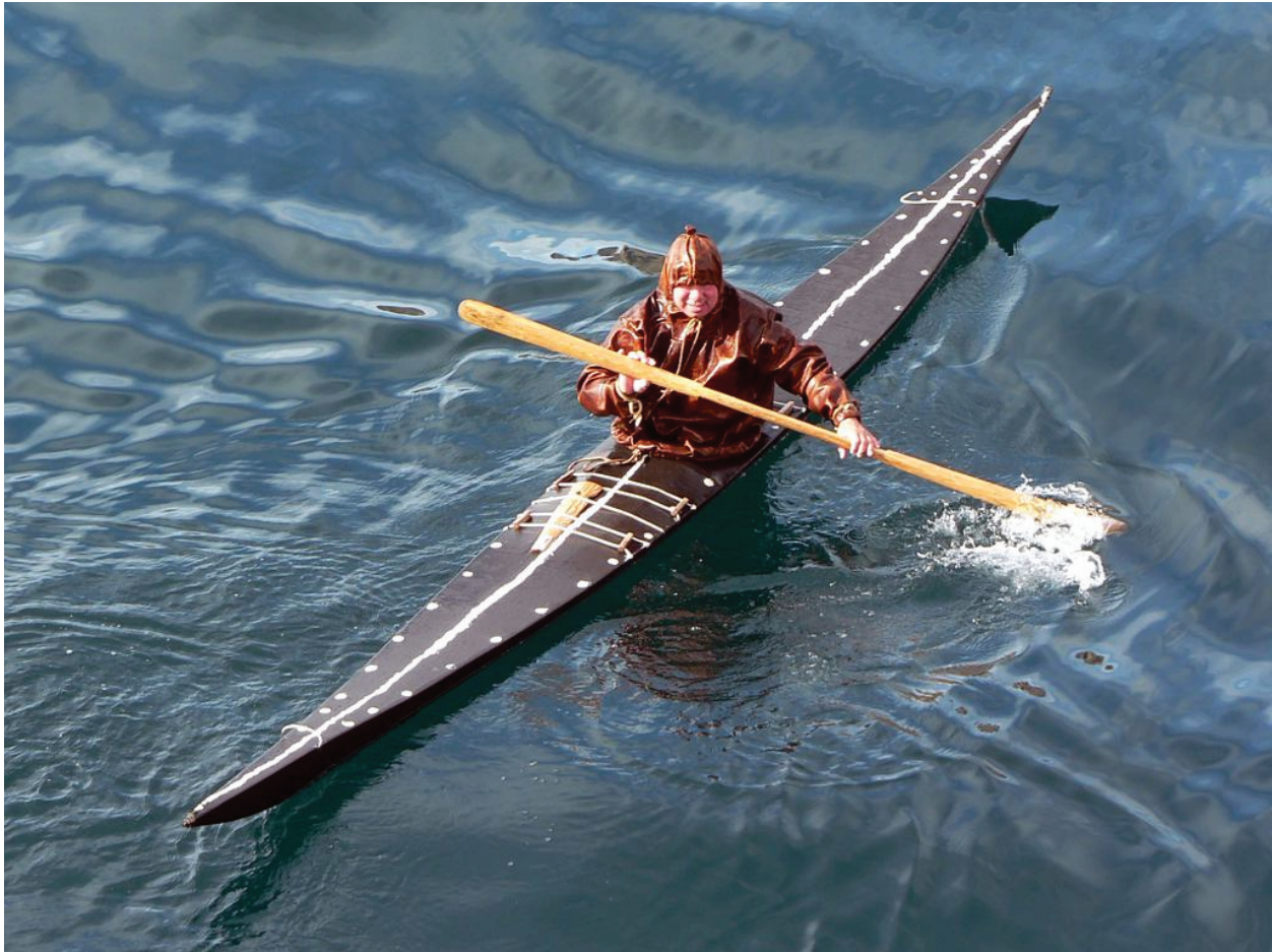
Fig 4.1: Inuit Kayaker