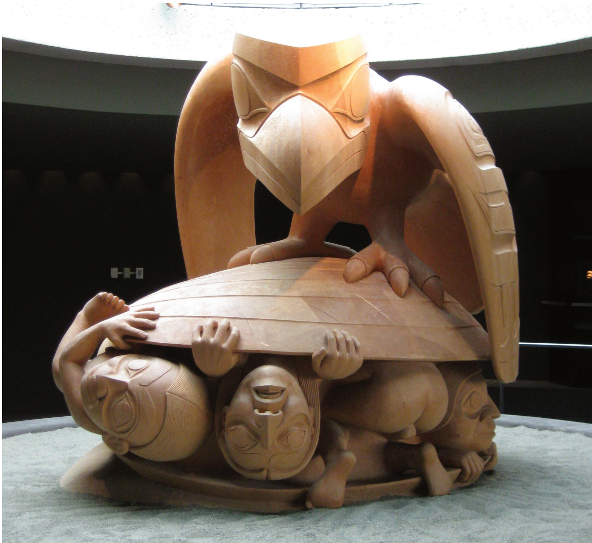
Fig 1.1 "Raven and the First Men" by Bill Reid, Museum of Anthropology, UBC, Vancouver, British Columbia