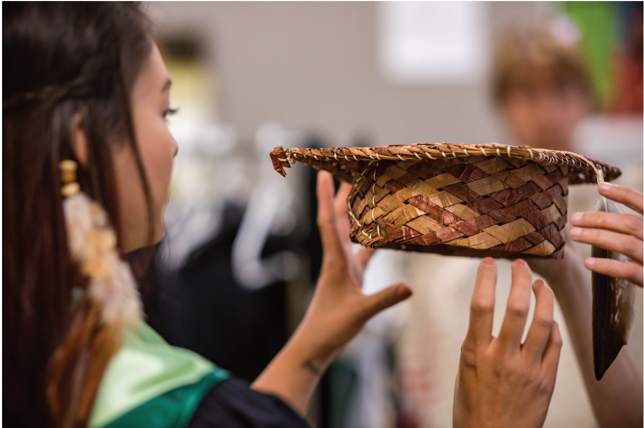
Fig 5.1: UFV Indigenous Graduate Reception 2017