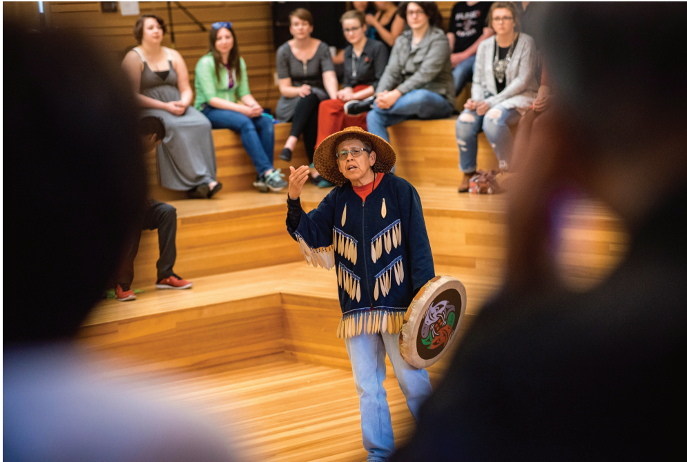
Fig 3.1: Indigenous Graduate Reception