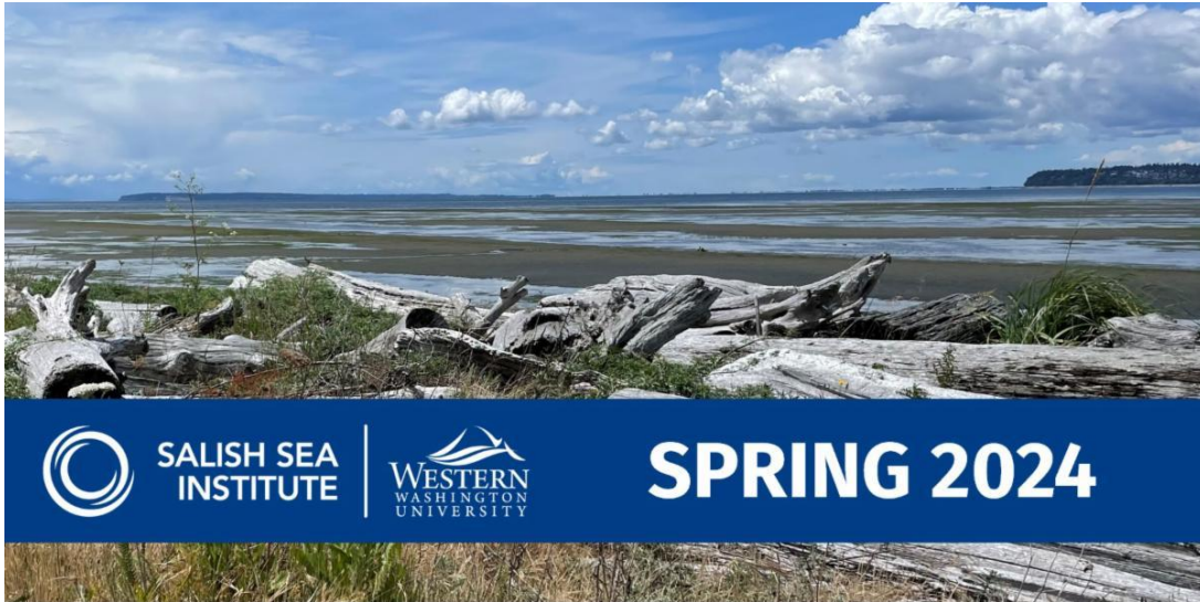
Photo of Semiahmoo at low tide