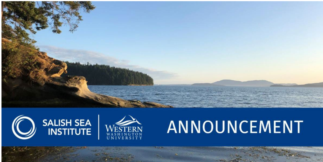
Photo of from Chuckanut Island