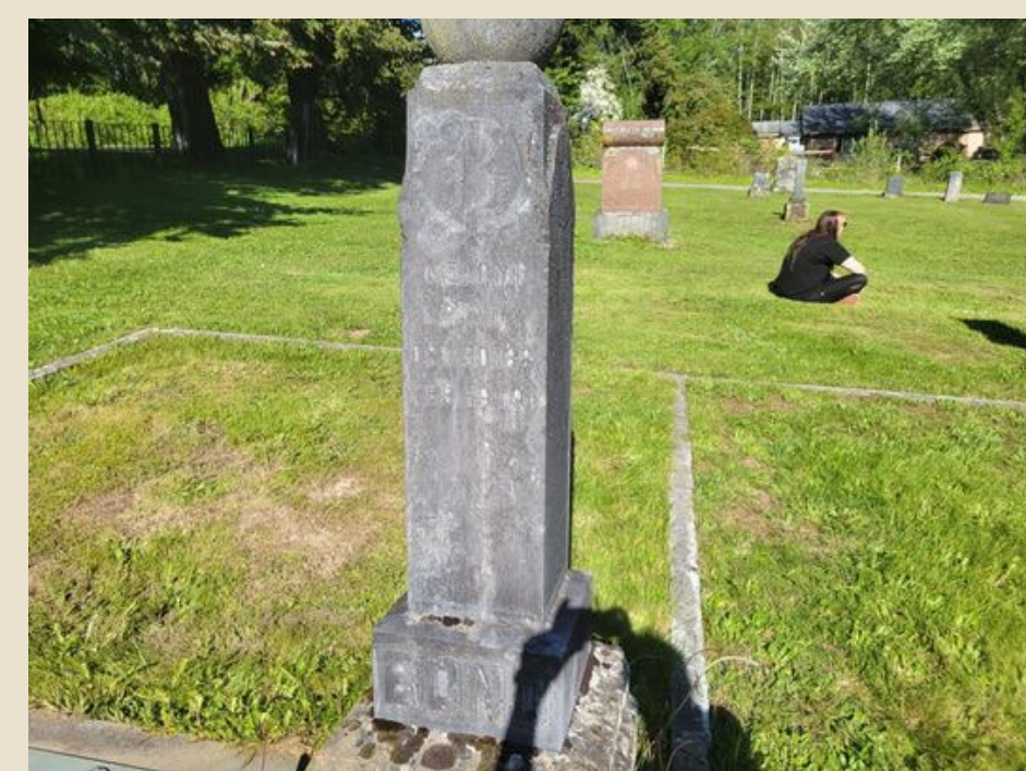
Figure 1. Here I am taking a photo of a gravestone while my friend sits in the background contemplating why she tagged along.

I went to the cemetery and took pictures of a group of tombstones. I went home with the data and made a table to sort through them. So, I sorted the data by date, size, and the motif. From there I was able to make some conclusions.